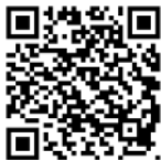
QR Code for Parish Hub to Sign Up

Please register for events on the Parish Hub at stmarysarlington.org/hub or email ( office@stmarysarlington.org ) or call (703-527-6800) the church office or scan QR code above. The church office is always happy to assist you in registering for events if you are having any trouble.