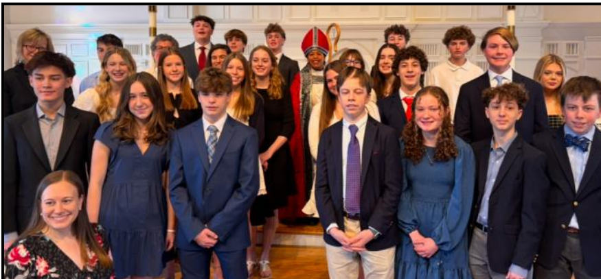
2025 Confirmation Class on February 23

View fellow parishioner's work in Merrow Fellowship Center on this special occasion.